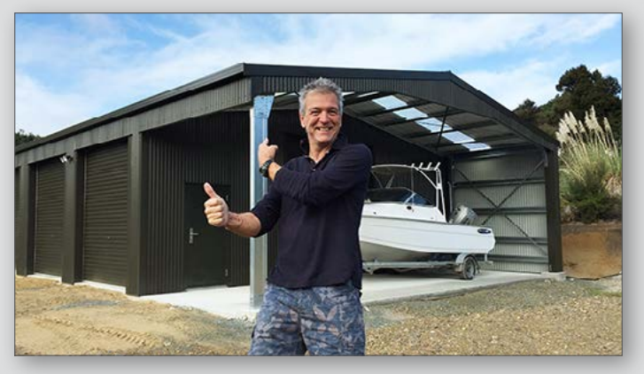
10m wide x 18m long x 3.4 high shed encorporating both secure and open bay storage.