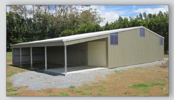
16m x 16m secure workshop with 6m lean-to Added feature is the clear-lights.