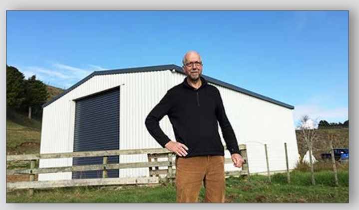
10m wide x 14m long x 4.3m high shed for farm machinery.