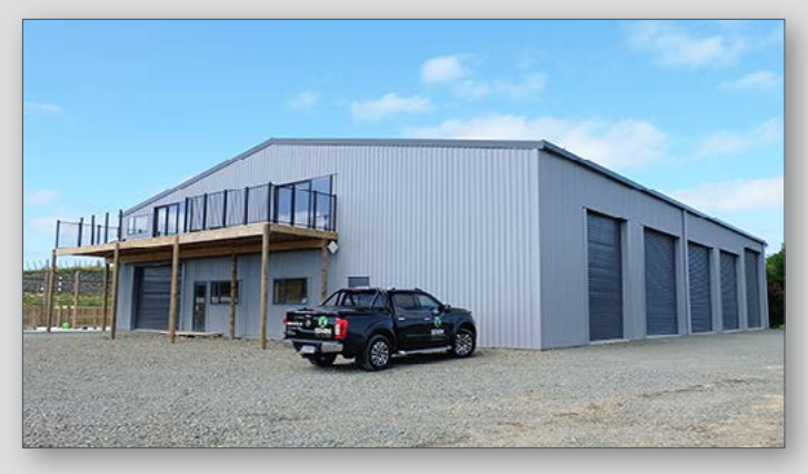
22m wide x 30m long x 55 high workshop with mezzanine office floor.