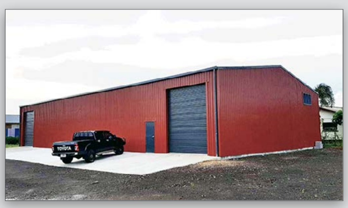
16m wide x 30m long x 4.3 high warehouse in Samoa.