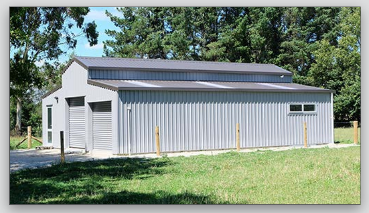
9m wide x 12m long x 3.6 high Heritage Barn.