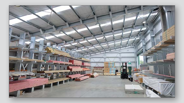
Clearspan monopitch at 21m wide x 32m long, high stud, drive-thru commercial warehouse for Carters Pukekohe, Auckland.