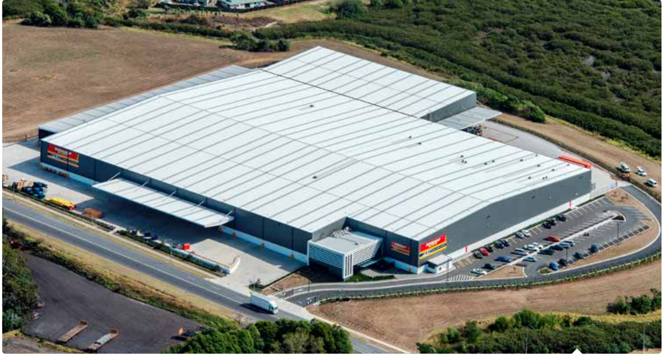
SUPERCHEAP AUTO WAREHOUSE, ONEHUNGA