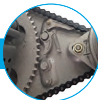
Chain Brake Lever