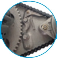
Chain Brake Lever